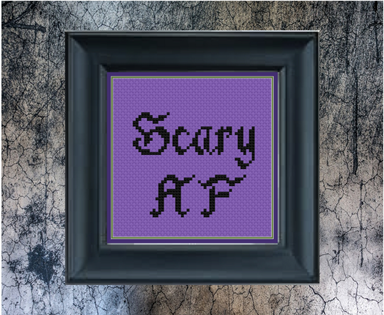
Scary AF Cross Stitch Pattern designed by GrandmabelWildin